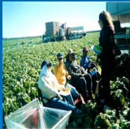
➤ Education and Outreach